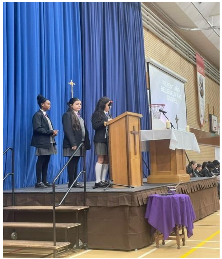
Our excellent student readers from lower and upper school Ash Wednesday Liturgies.