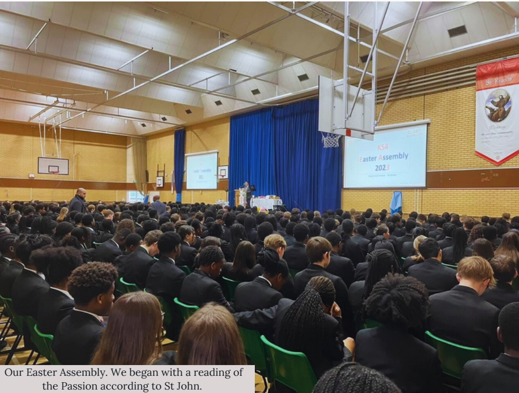
Our Easter Assembly. We began with a reading of the Passion according to St John.

HE IS NOT HERE, FOR HE IS RISEN, AS HE SAID.