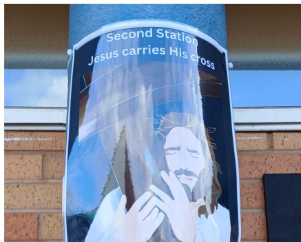
Year 8 Stations of the Cross