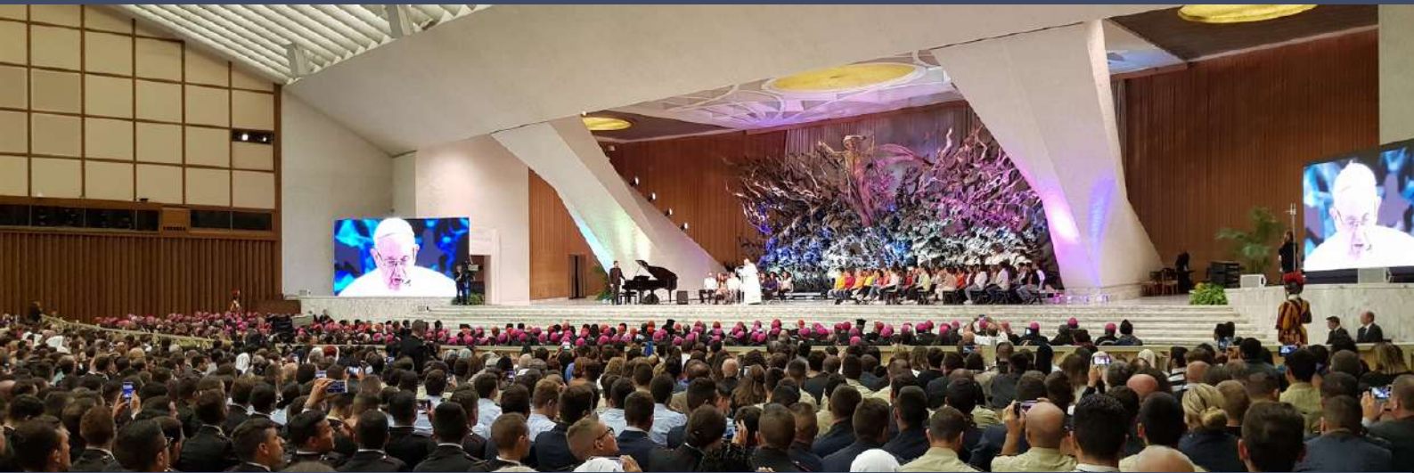
ALL SAINTS STUDENTS AT AN AUDIENCE WITH HIS HOLINESS POPE FRANCIS I