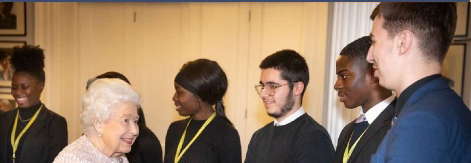
A MEETING WITH HER MAJESTY QUEEN ELIZABETH II