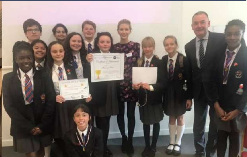
WORKING WITH JON CRUDDAS MP