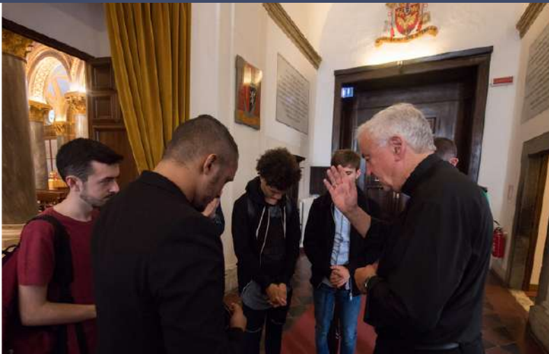
A BLESSING BY HIS EMINENCE VINCENT CARDINAL NICHOLS