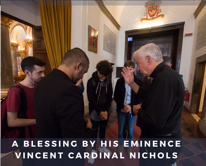
A BLESSING BY HIS EMINENCE VINCENT CARDINAL NICHOLS