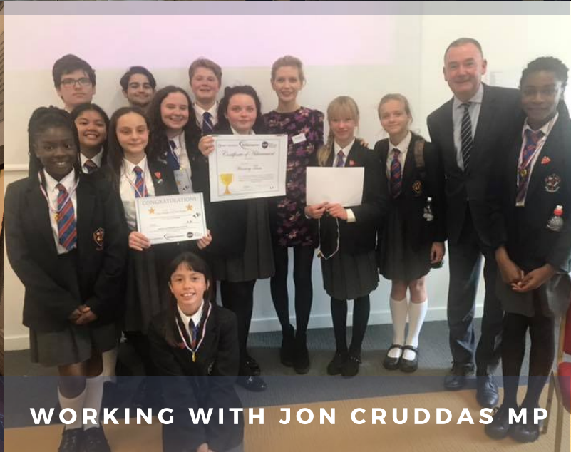
WORKING WITH JON CRUDDAS MP