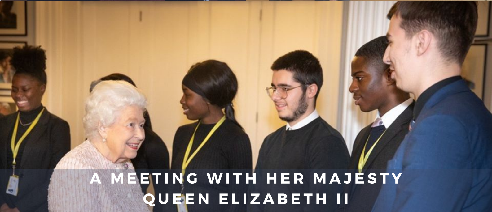
A MEETING WITH HER MAJESTY QUEEN ELIZABETH II