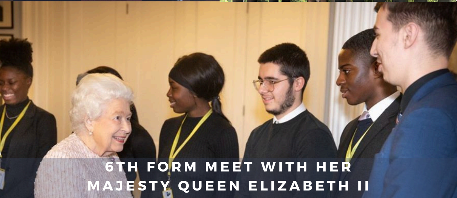
6TH FORM MEET WITH HER MAJESTY QUEEN ELIZABETH II