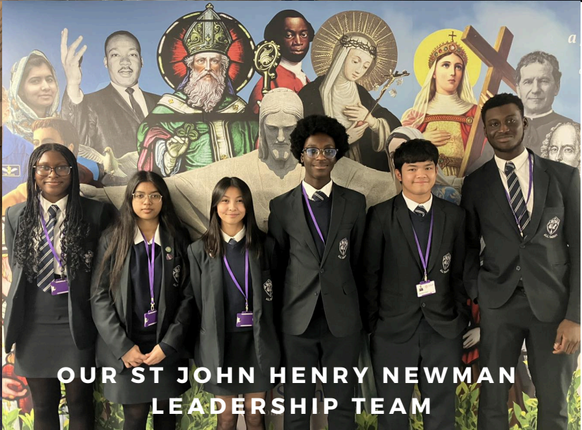
OUR ST JOHN HENRY NEWMAN LEADERSHIP TEAM