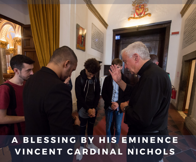
A BLESSING BY HIS EMINENCE VINCENT CARDINAL NICHOLS