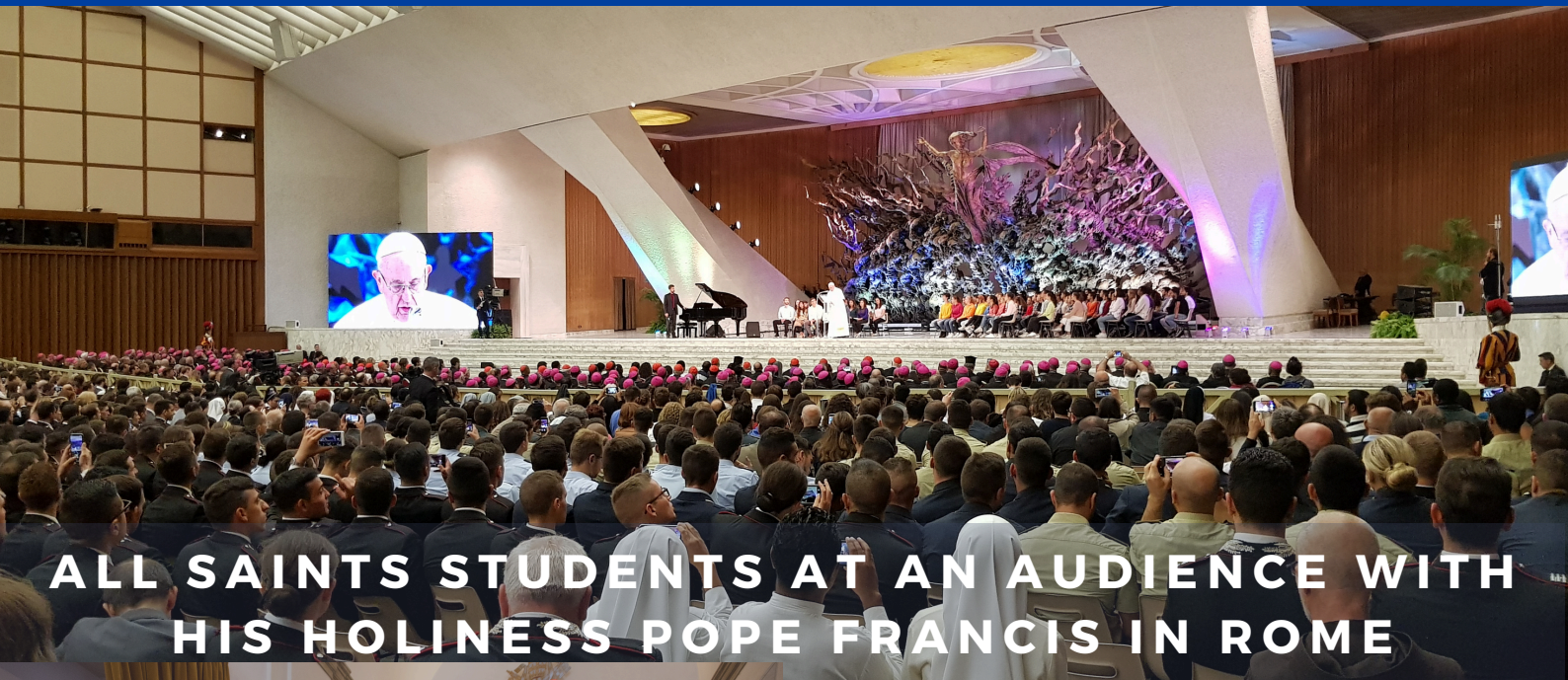
ALL SAINTS STUDENTS AT AN AUDIENCE WITH HIS HOLINESS POPE FRANCIS IN ROME